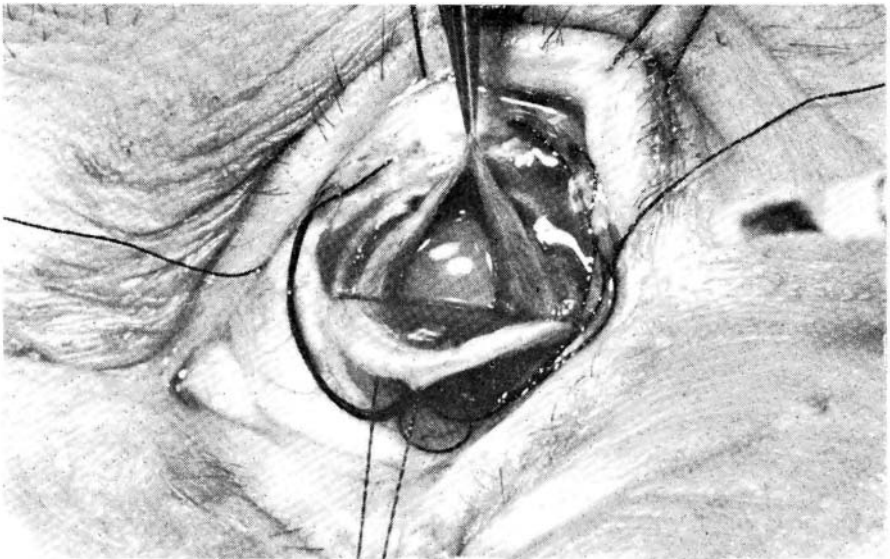
Fig. N° 2

The corneal flap is lifted and is held in this position by the auxiliary suture. The forceps grasps the iris, and the cryoextractor is ready for use.